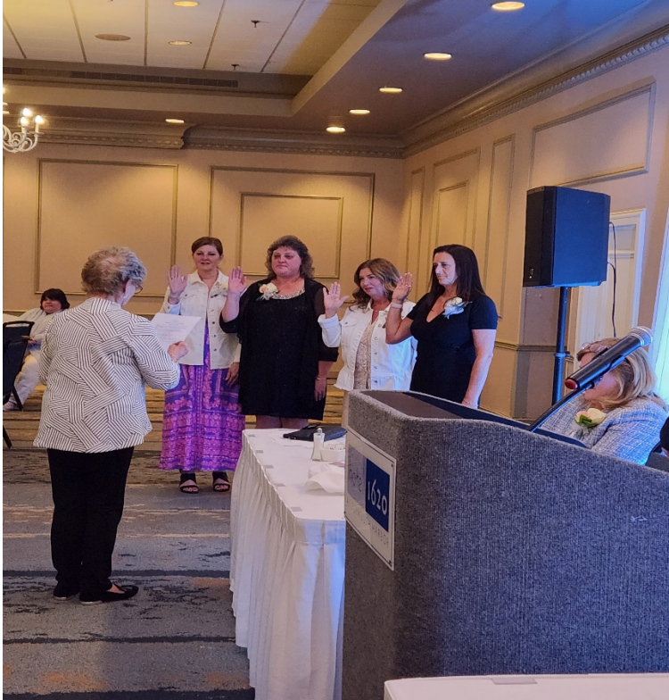
Swearing in of the MTCA Officers